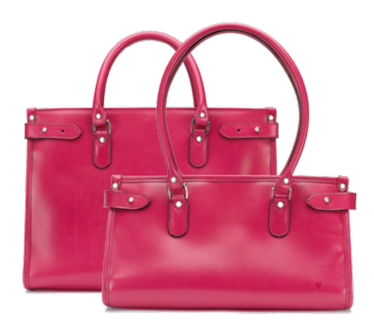
Kimbolton Classic Tote £315, Kimbolton Mini £285