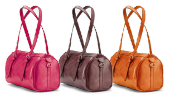
Available in four colours, £285

A classic roll-bag shape with adjustable handles. Gorgeous.