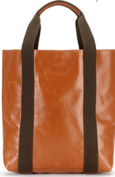
EcoTote - our lovely leather answer to the 'bag for life'. In six colours. £85