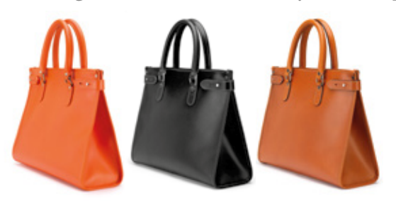
Available in seven colours, £315

Our signature work tote, this really popular bag is a small briefcase, a large handbag, but above all, a seriously chic companion.