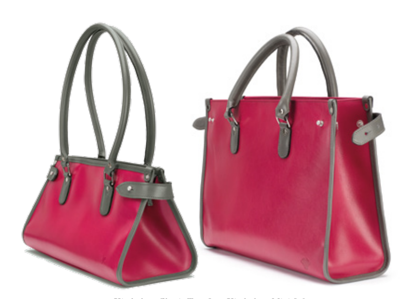
Kimbolton Classic Tote £315, Kimbolton Mini £285