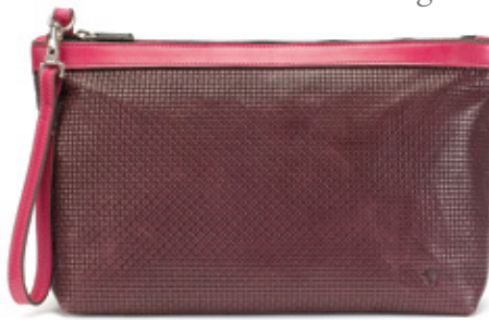
Puxley Pouch – super versatile pouch or fashionable clutch with detachable wrist strap – in two sizes from £85