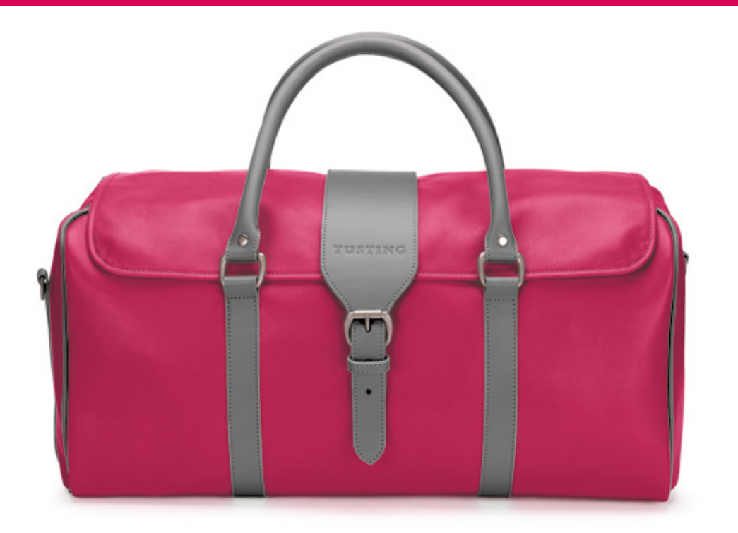
Encounter Holdall £490