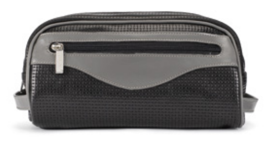
Excursion Washbag – capacious and great looking, lined in waterproof nylon twill from £89