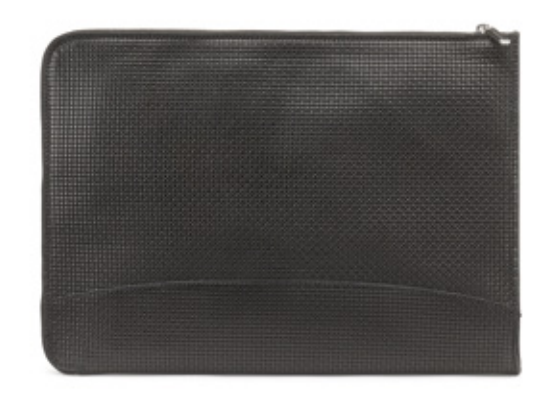
iFolio – padded throughout to take care of your notebook computer and incorporates a special interior pocket for your iPad, Kindle or tablet. £240