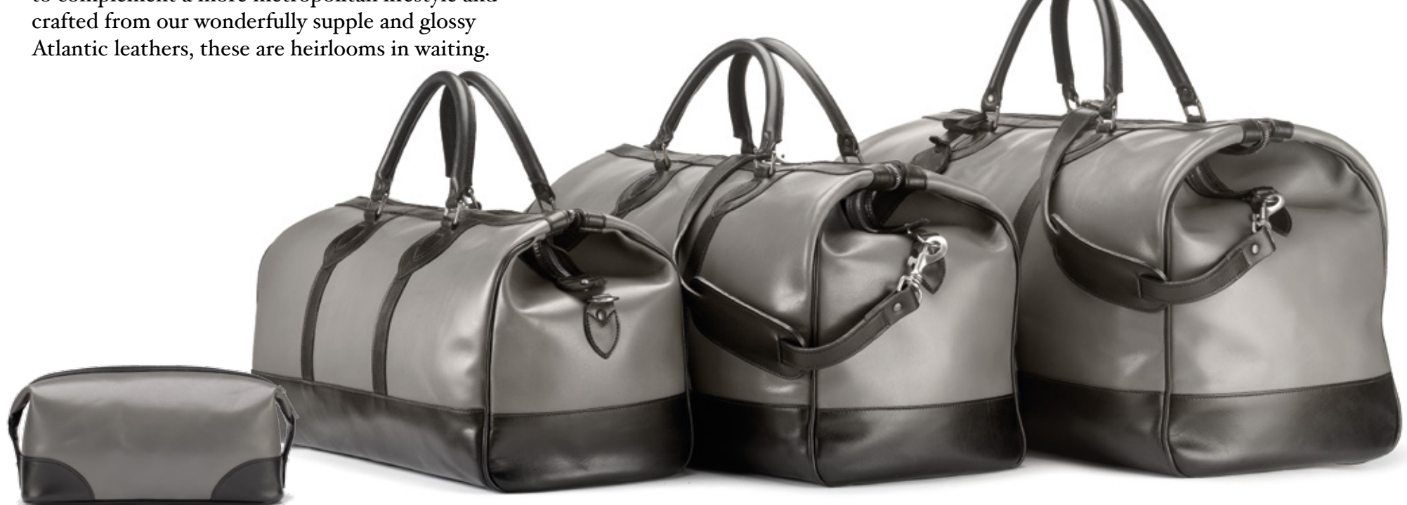
Expedition Washbag £135

Tilbrook takes urban chic to the soft forms that Tusting is all about. In cool and masculine colours to complement a more metropolitan lifestyle and