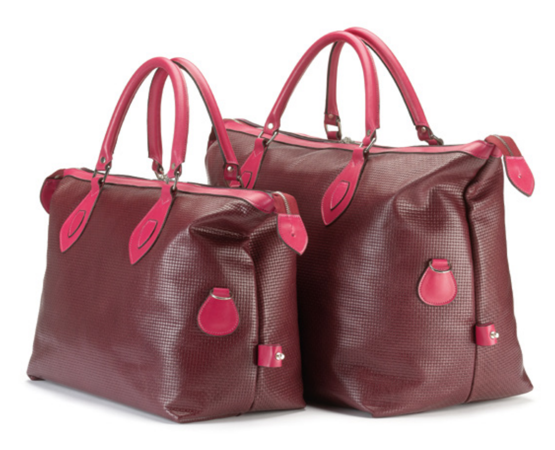
Explorer (small) £399, Explorer (medium) £485