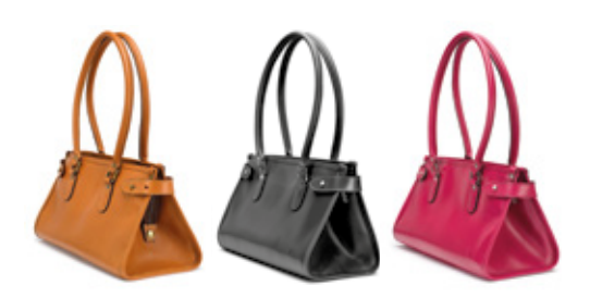
Available in four colours, £285

The baby sister of our iconic Kimbolton Tote, the Mini fits perfectly over your shoulder and hides a capacious interior. A great day-bag.